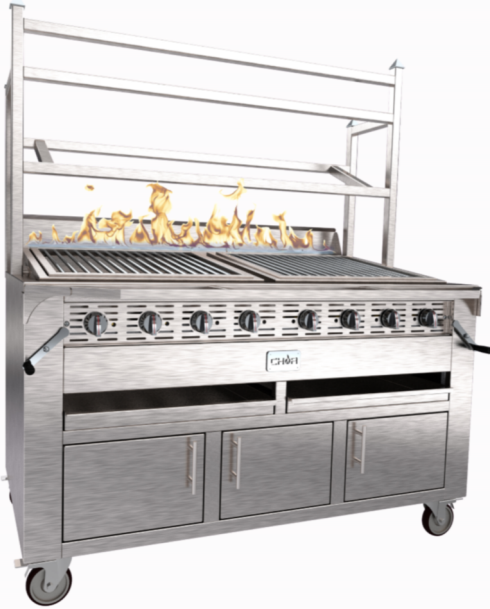
CP-EX16118-15NG WITH OPTIONAL CABINET BASE and FEATURE FLAME